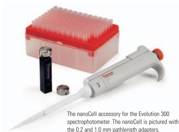
The nanoCell accessory for the Evolution 300 spectrophotometer. The nanoCell is pictured with the 0.2 and 1.0 mm pathlength adapters.