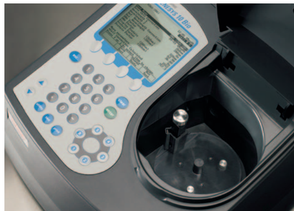
GENESYS 10 Bio spectrophotometer with the nanoCell accessory