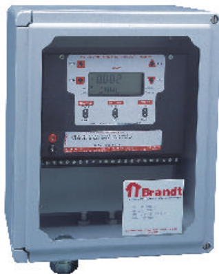
MST2400 NEMA 4X