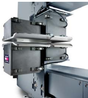
Dual Thermo Scientific FSIR Sensors Shown

This enhanced high-resolution design incorporates improved optics that provides 3 times better streak resolution. This aids in die control and provides higher detail layer distribution analysis.