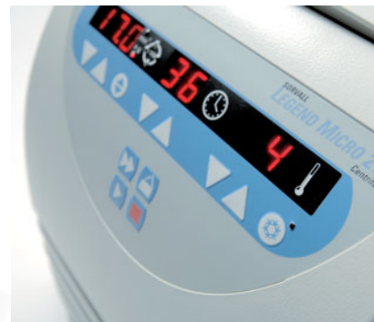
Sorvall Legend Micro 21R Refrigerated Microcentrifuge