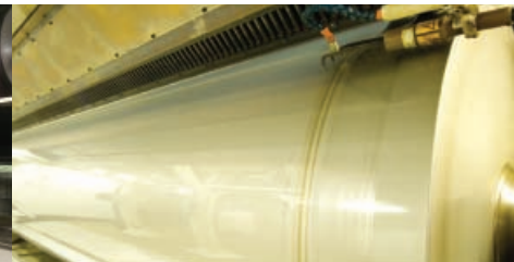
At the reel: Perfect profiles build perfect rolls