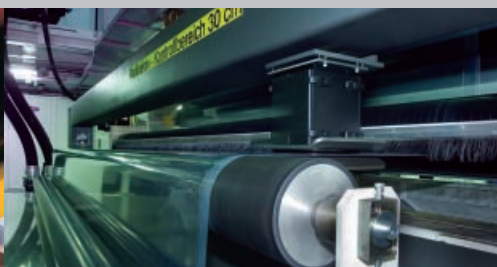
Thermo Scientific Mark III scanner on the stretch film line C05