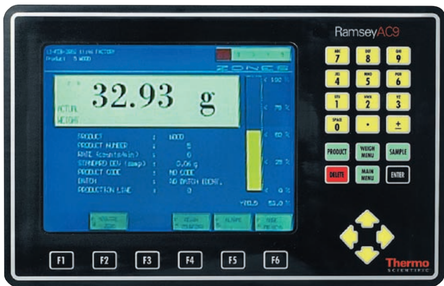
AC9 GP Checkweigher