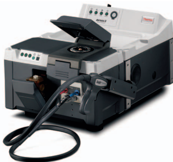
Figure 1: The Thermo Scientific Antaris II FT-NIR analyzer showing different available detection options

Researchers at IREL, spol. s.r.o. (Brno, Czech Republic) explored FT-NIR spectroscopy as a means to rapidly identify herbs used to produce extracts found in nutraceuticals, cosmetics and pharmaceuticals. Their biological origin means that many herbs contain similar components, like cellulose, proteins and sugars, which tend to result in similar spectra. The purpose of this application note is to demonstrate that complex herbal materials can be correctly classified using FT-NIR spectroscopy much more rapidly than conventional techniques.