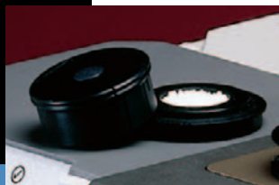
Figure 2: Antaris II analyzer with the closed sample cup and spinner

Three or four samples of each herb were scanned with an Antaris™ II FT-NIR system in the range between 10,000 and 4,000 \text{cm}^{-1} . The materials were placed in a closed rotating sample cup with a 30 mm window over the