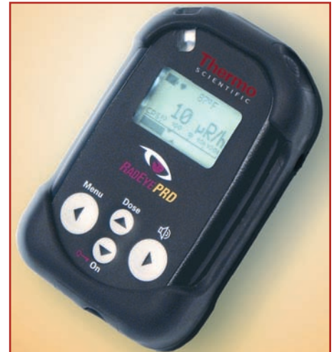
The RadEye PRD is 5,000 – 100,000 times more sensitive than a typical electronic dosimeter. This capability is achieved through a special technique based on the company's patented Natural Background Reflection (NBR) technology.

"A complete line of high-sensitivity instruments and devices" specifically designed for use by U.S. and allied defense and law-enforcement agencies and organizations "to detect illicit radioactive materials and to monitor ... [suspect] areas for radioactivity." That is the noble goal, briefly summarized, and mission set for itself by Thermo Fisher Scientific, which designs, develops, and builds a full range of products, ranging from hand-held devices to "entirely integrated solutions," that serve "the entire radiation-measurement needs" of U.S. homeland-security professionals.