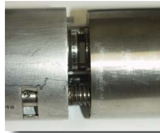
Figure 4. Probe sections fully pressed together

4. Push the two sections together as far as they will go.