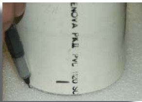
Figure 6. Measuring/marketing the foam

2. Place the end of the PVC on the piece of foam to mark the foam for the cut. Cut about an eighth of the inch inside the marked line, and test the foam for a secure fit inside the PVC.