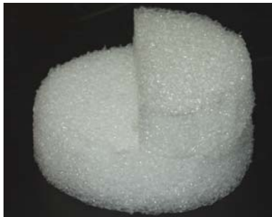
Figure 7. Foam cut to match pneumatic pins

4. Fit the foam into the end of the pipe, then install the PVC cap over the foam.