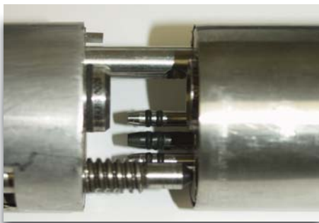
Figure 3. Probe sections lightly pressed together

4. Push the two sections together as far as they will go.