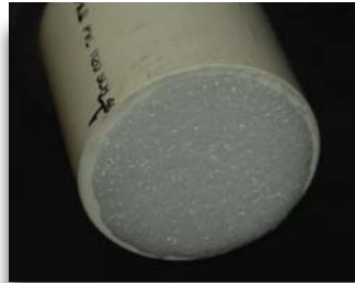
Figure 8. Foam installed in PVC

4. Fit the foam into the end of the pipe, then install the PVC cap over the foam.