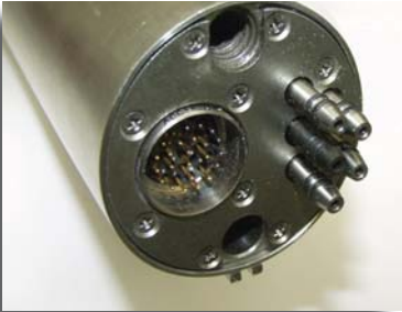
Figure 1. Electronic and pneumatic pin connections

1. Examine the electronic and sample pneumatic pins, especially the Torlon (plastic) pin. They should be straight and free of any debris. The O-rings on each should be in place, and properly lubricated.