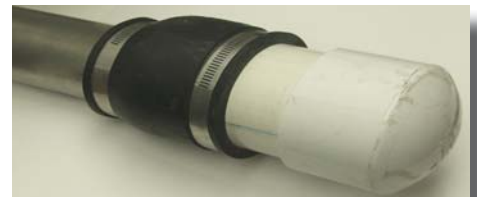
Figure 9. Install the cover

Questions please call 1-800-282-0430 to reach a technical support representative or email service.aqi@thermoifhser.com