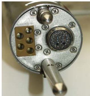
Figure 2. Holes for matching pin connectors

3. Lay the two sections of the probe on a flat surface (or carefully support each section). Lightly push the sections together so the alignment bar and connection screw line up.