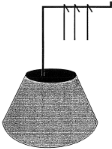
Fig.2: Wire Holder Stand